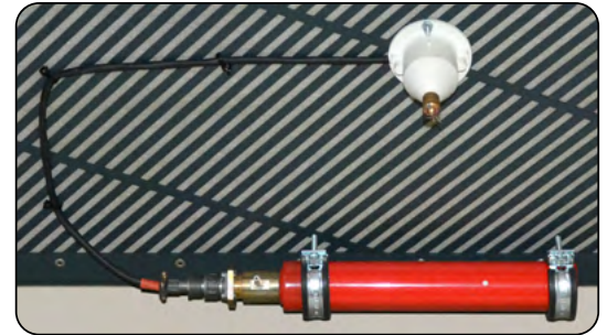
Aerosol extinguishing system

Generally, aerosol is described as a mixture of gas with solid and/or liquid suspended particles. The release or combustion of the solid matter contained in the LiBa®Sol generators creates an aerosol of solid and gaseous particles. These spread throughout the entire cabinet in milliseconds, displacing oxygen, diluting combustible gases and starting the extinguishing process in the process!