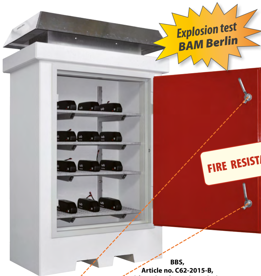
BBS, Article no. C62-2015-B, with optional exterior painting

For the safe storage of lithium-ion batteries