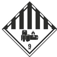
Safety marking according to ADR regulation