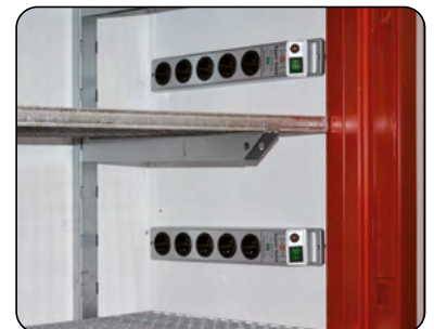
Charging device with socket strip 5-fold