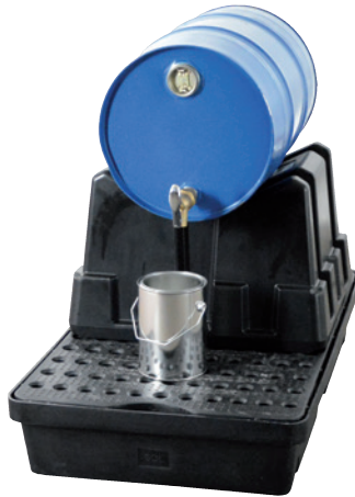
FB 1-Combi, with 60 liter drum, Article no. P70-2031-A

When not in use, the drum stand can be stacked to save space!