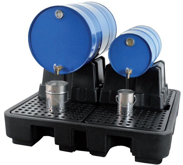
FB 2-Combi, Article no. P70-2033-A, e.g. 1x 200 liter drum and 1x 60 liter drum