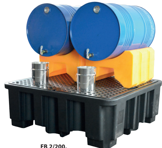
FB 2/200, Article no. P70-7114-A