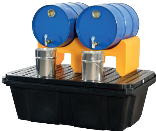
FB 2/60, Article no. P70-7113-A