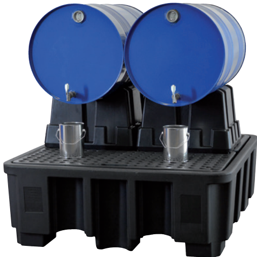
FB 2-Combi, Article no. P70-2033-A, e.g. 2x 200 liter drum