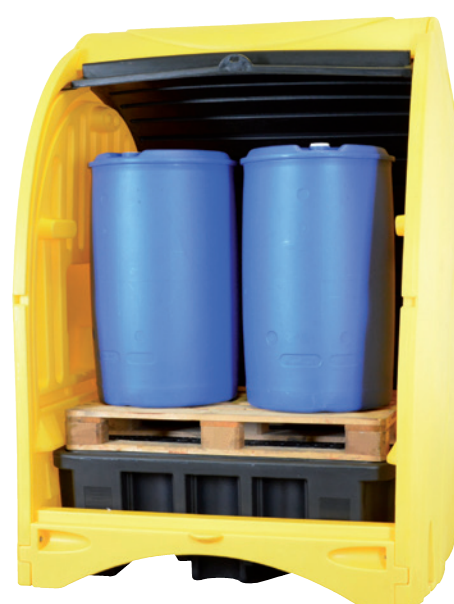
PE-ST-45, Article no. P70-2054-A