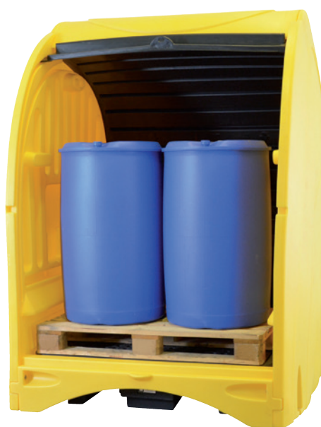
PE-ST-4, Article no. P70-2053-A