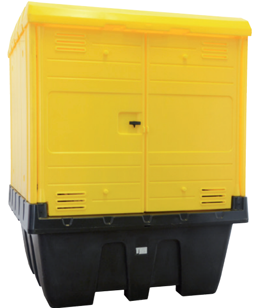
PE-ST-KT, Article no. P70-2055-A, with double wing door lockable

Safety storehouses for KTC / IBC can be found on page 146/147!