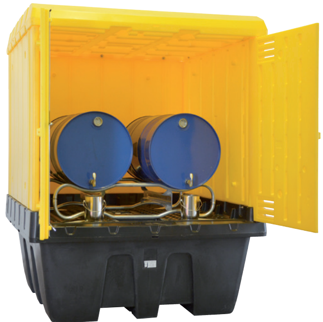
PE-ST-KT, Article no. P70-2055-A, with optional drum pallet