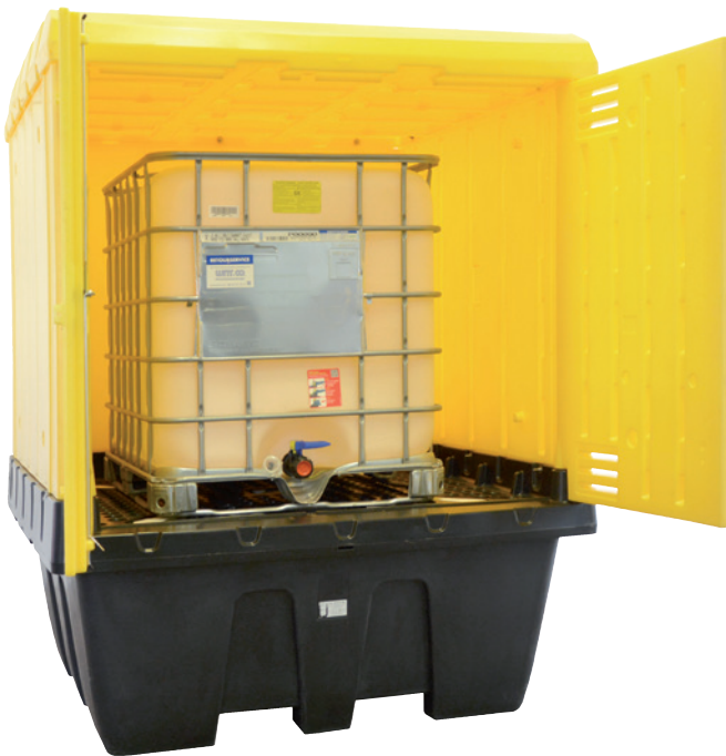
PE-ST-KT, Article no. P70-2055-A