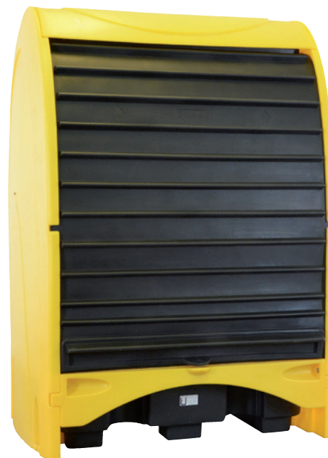
PE-ST-2, Article no. P70-2052-A