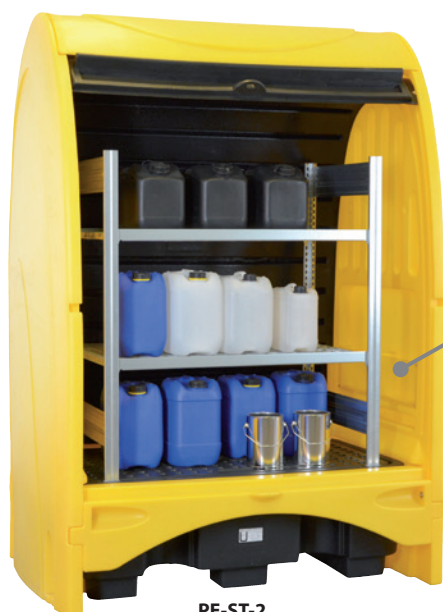
PE-ST-2, Article no. P70-2052-A, with optional shelf set