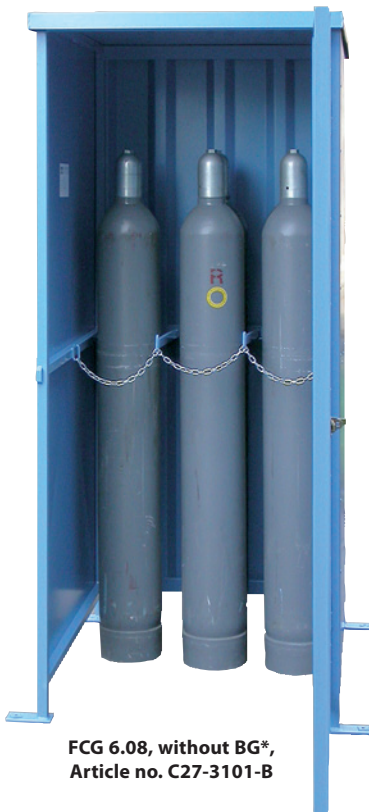
FCG 6.08, without BG*, Article no. C27-3101-B