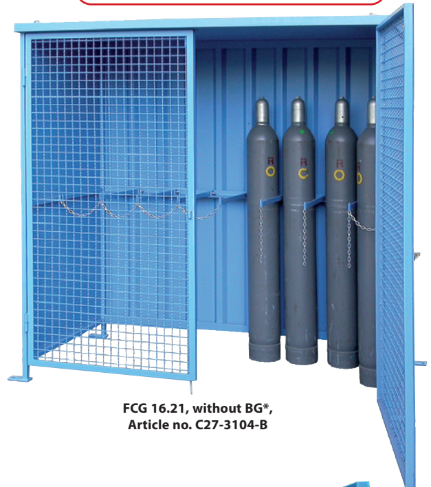
FCG 16.21, without BG*, Article no. C27-3104-B