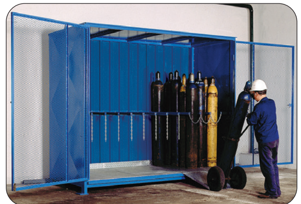
FCG-E.3.48, with base group, Article no. C27-3110-B