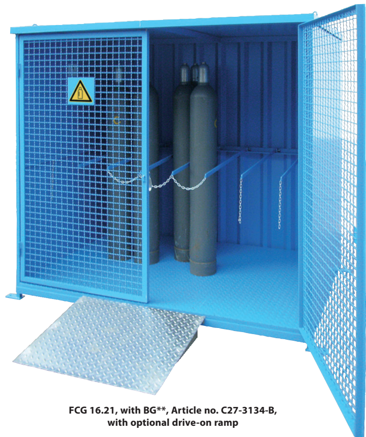
FCG 16.21, with BG**, Article no. C27-3134-B, with optional drive-on ramp