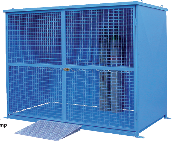
FCG 30.13, with base group, Article no. C27-3121-B, with optional drive-on ramp

Complies with TRGS 510 (Technical Rules for Pressurized Gases)