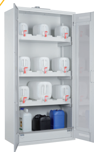
CHS-KAN 950 GL, doors RAL 7035 Article no. B80-6234-A