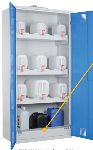
CHS-KAN 950, doors RAL 5015 Article no. B80-6458-A