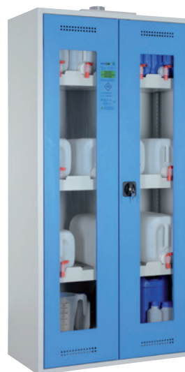
CHS-KAN 950 GL, doors RAL 5015 Article no. B80-6463-A