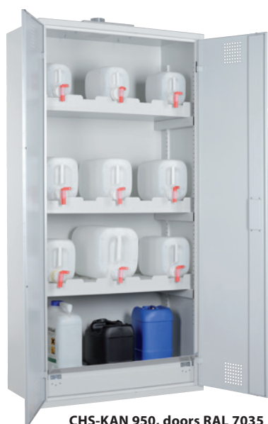
CHS-KAN 950, doors RAL 7035 Article no. B80-6233-A