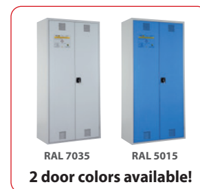
2 door colors available!