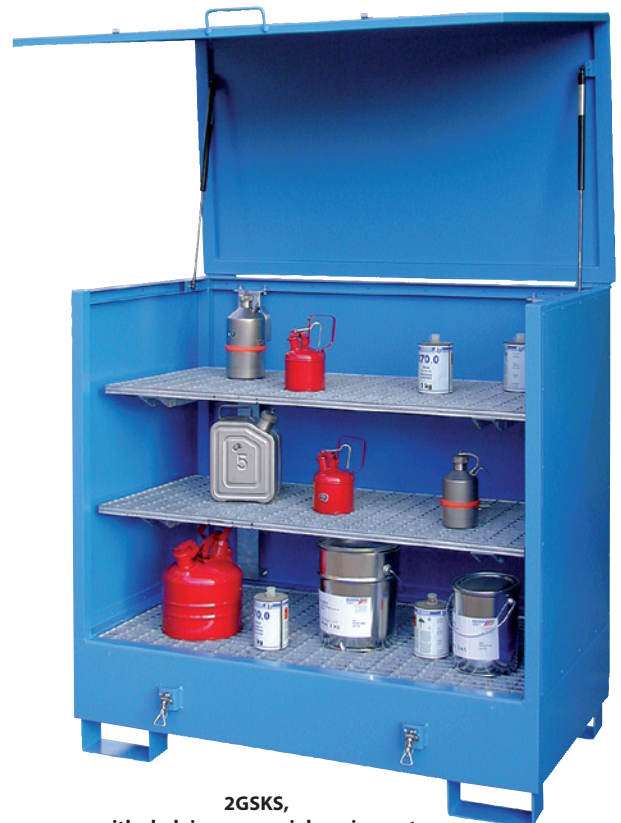
2GSKS, with shelving as special equipment