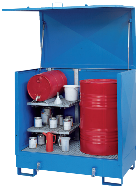
2GSKS, with shelving as special equipment