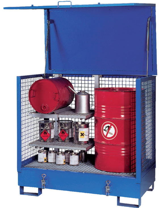
2GSKS / Gitt, with shelving as special equipment