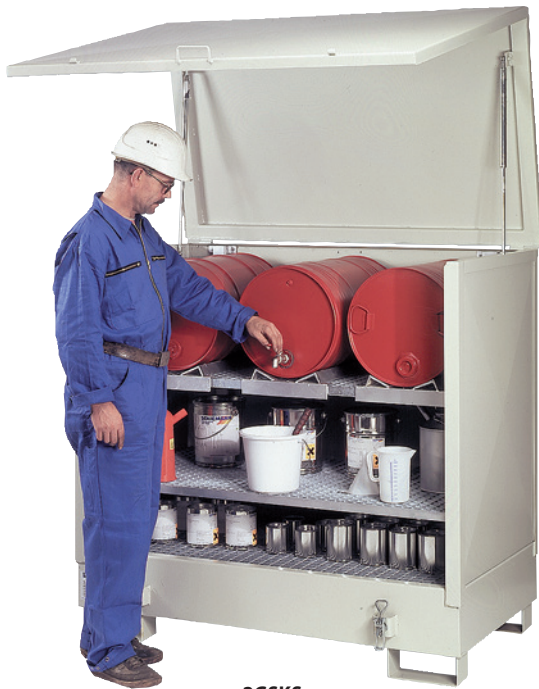
2GSKS, with shelving as special equipment