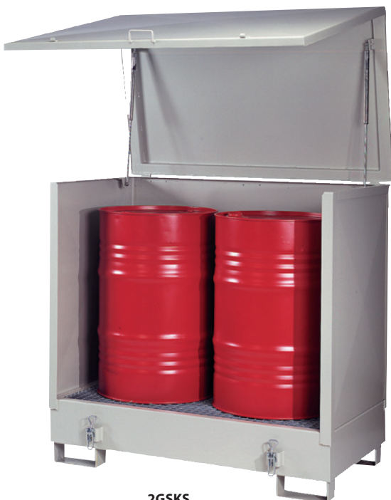
2GSKS, Article no. P21-2503-A