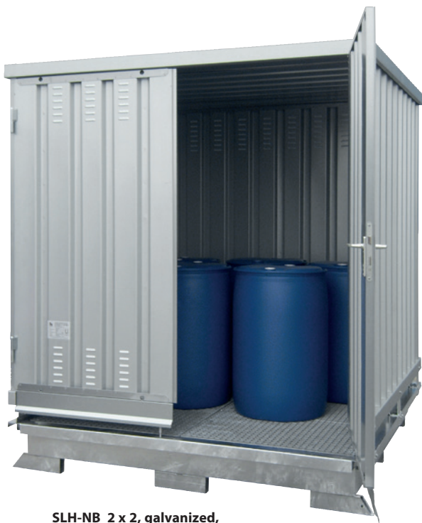
SLH-NB 2 x 2, galvanized, Article no. H63-1101-A