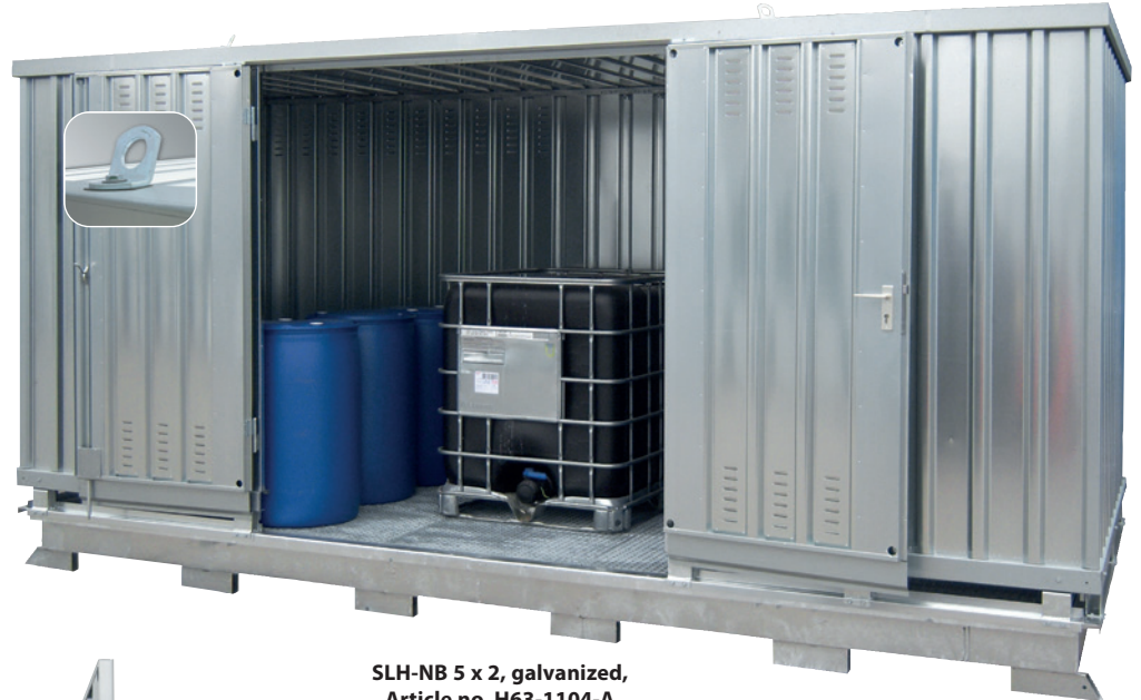
SLH-NB 5 x 2, galvanized, Article no. H63-1104-A

Double door in long side as standard, doors in short side on request! For sizes 5 x 6, 5 x 8, 4 x 6 and 4 x 8 double door in short side!