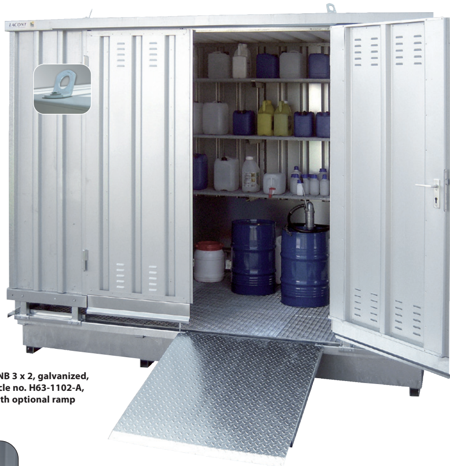
SLH-NB 3 x 2, galvanized, Article no. H63-1102-A, with optional ramp

Rate of air exchange has been tested and approved in accordance with the latest requirements of DIBt Berlin!