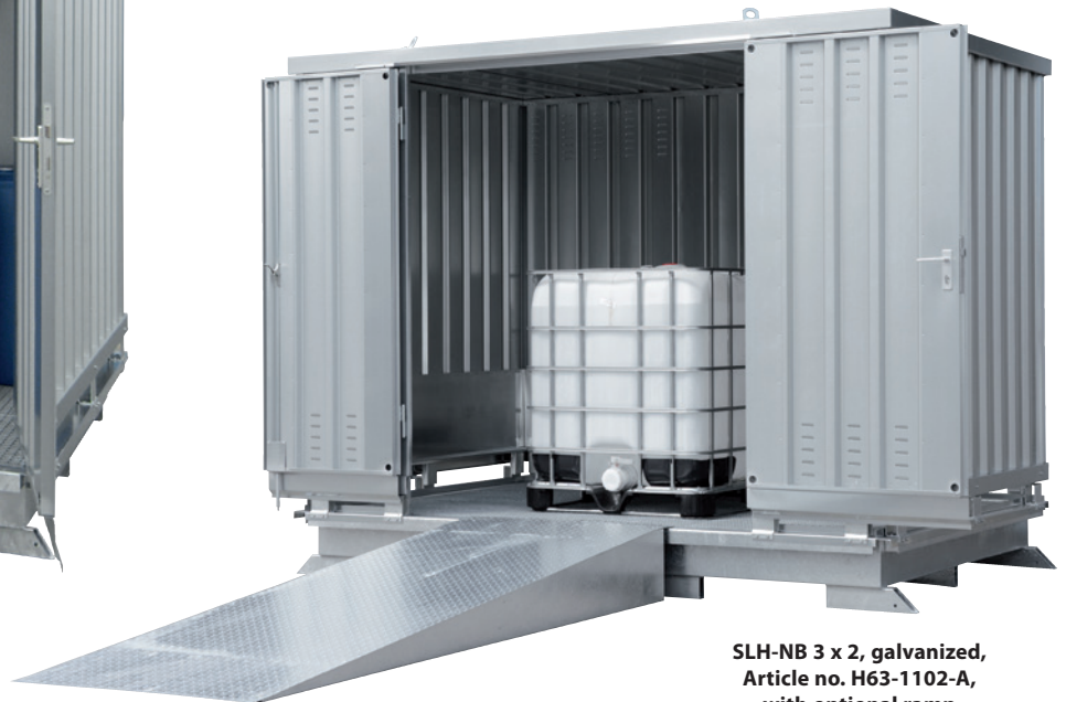
SLH-NB 3 x 2, galvanized, Article no. H63-1102-A, with optional ramp