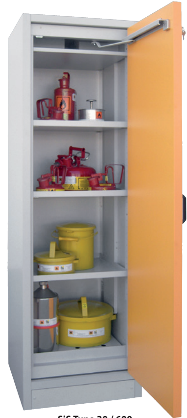
SiS Type 30 / 600, Article no. B80-2603-A, door RAL 1007 - daffodil yellow, incl. 3 shelves, base sump tray and perforated cover plate