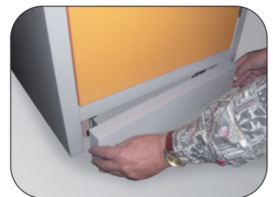
Socle included, with removable panel