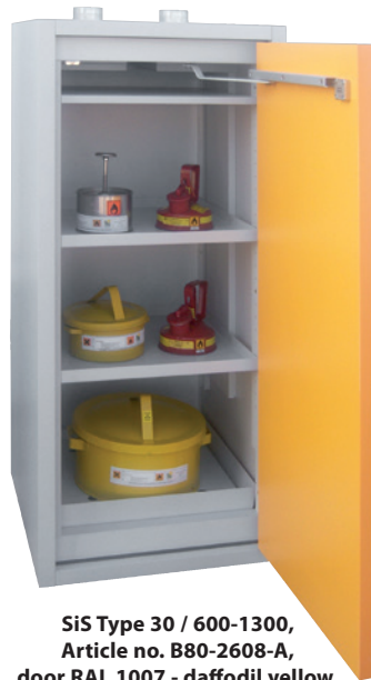
SiS Type 30 / 600-1300, Article no. B80-2608-A, door RAL 1007 - daffodil yellow, incl. 2 shelves, base sump tray and perforated cover plate